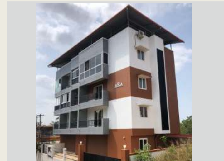
Sri Devidayal Ara, Maryhill