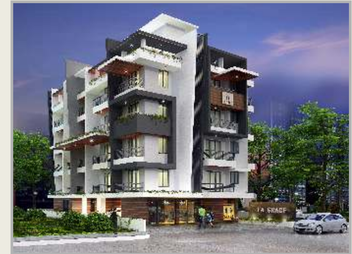
Sri Devidayal La Grace, Yeyyadi