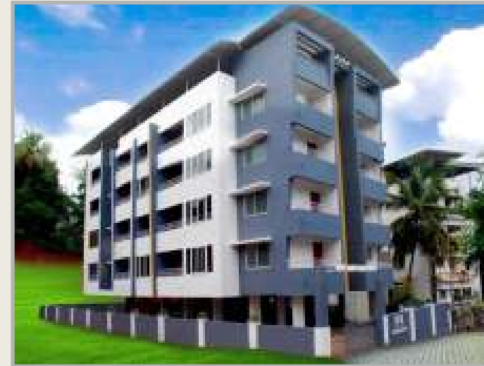
Sri Devidayal Residency, Ashoknagar