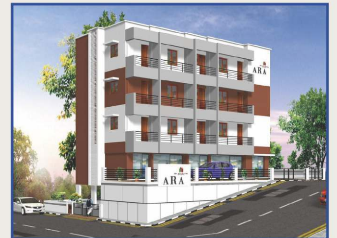
Sri Devidayal Ara, Maryhill