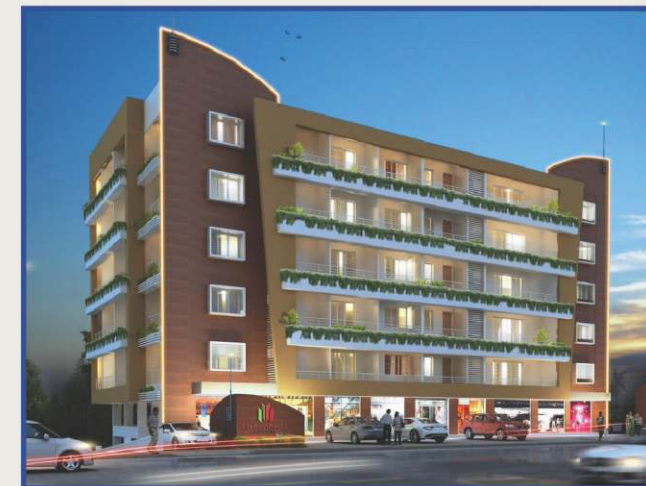
Sri Devidayal Canopus, Urvastore