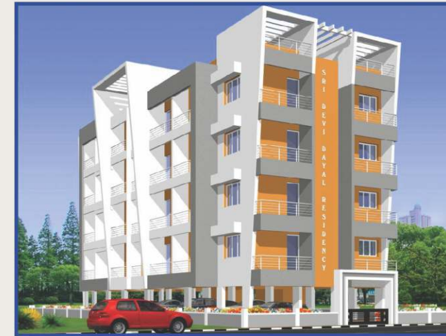
Sri Devidayal Residency, Ashoknagar