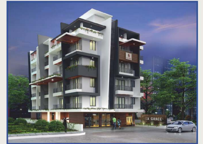
Sri Devidayal La Grace, Yeyyadi